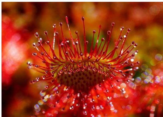
It's worth taking a closer look: Carnivorous plant